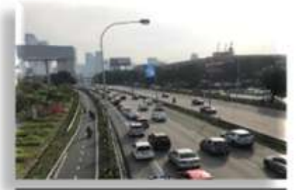
Exclusive lane (EML)

Exclusive Motorcycle lanes (EML) are forgiving roads infrastructure with physical barrier and have potential to reduce fatal crashes by 80%*.