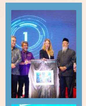
International Confer Maritime Logistics a Malaysia