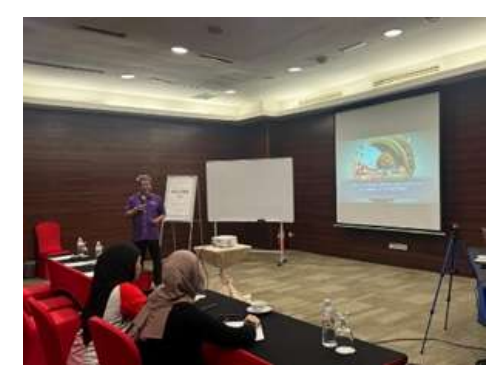
SOME OF THE PHOTOS TAKEN DURING THE PROGRAM