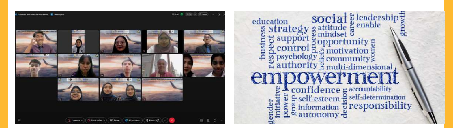
Round Table Discussion (RTD): A Success in Aviation Sustainability by UUM in collaboration with Next Gen CILT Malaysia

To provide a forum where students and next generation professionals can expand their sector knowledge, start building their professional networks, learn and practice presentational, collaborative, strategic and leadership skills, and move on to become successful professionals and highly effective participants in CILT branches, territories and international leadership